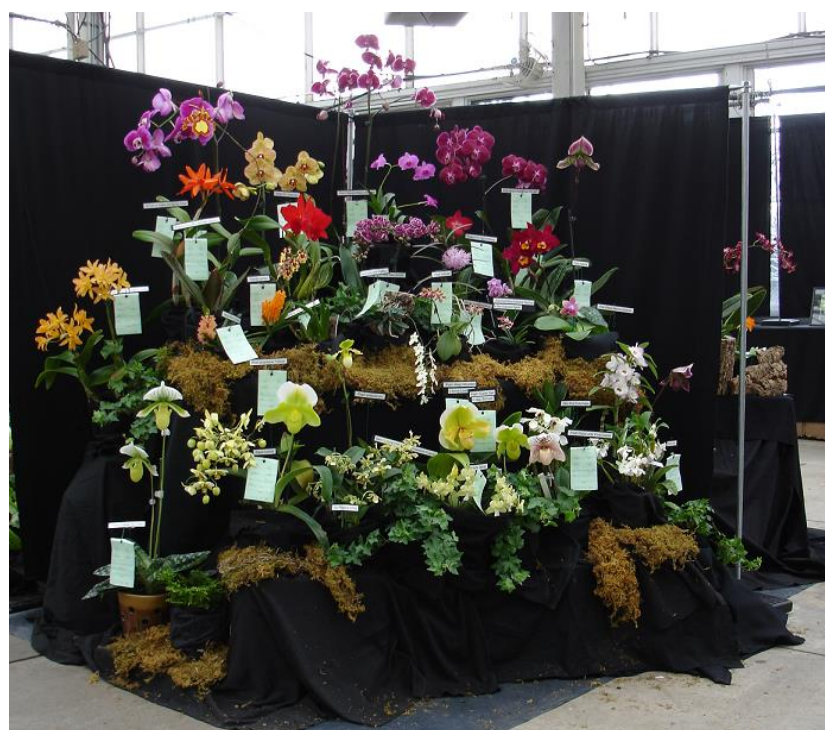
Our exhibit at the Greater Akron Orchid Society Show March 4th & 5th. The exhibit won the blue ribbon in its class and the People's Choice Award