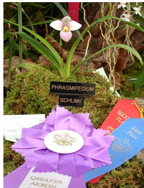
Edgar Stehli's Phrag schlimii won best phragmipedium