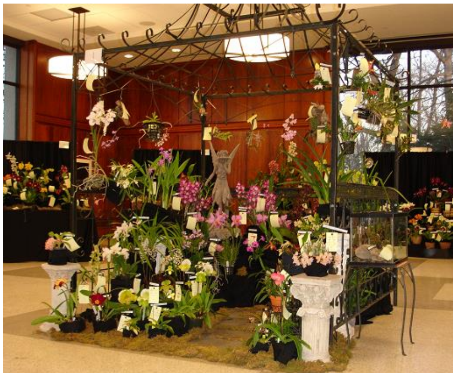
GCOS's exhibit at our spring show