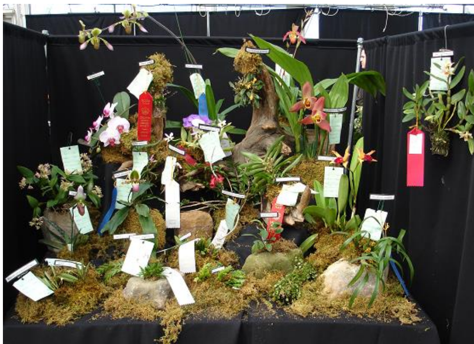
Patty Conrad's exhibit at the GAOS show last week

Welcome to the 42 new members who joined at our show at the Cleveland Botanical Gardens last month. If you haven't yet been to our website please check out www.gcos.org . To log into the members' only content: